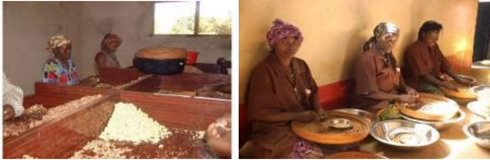
Women processing cashew in Moginqual District, Nampula

Personal Views. One producer consulted on the change he can see after SNV's intervention, explained: "Considering that the processors' operating period has increased with the existence of more raw material, we are going to work for a longer period of time, and in doing so we will guarantee more resources to have our children in school".