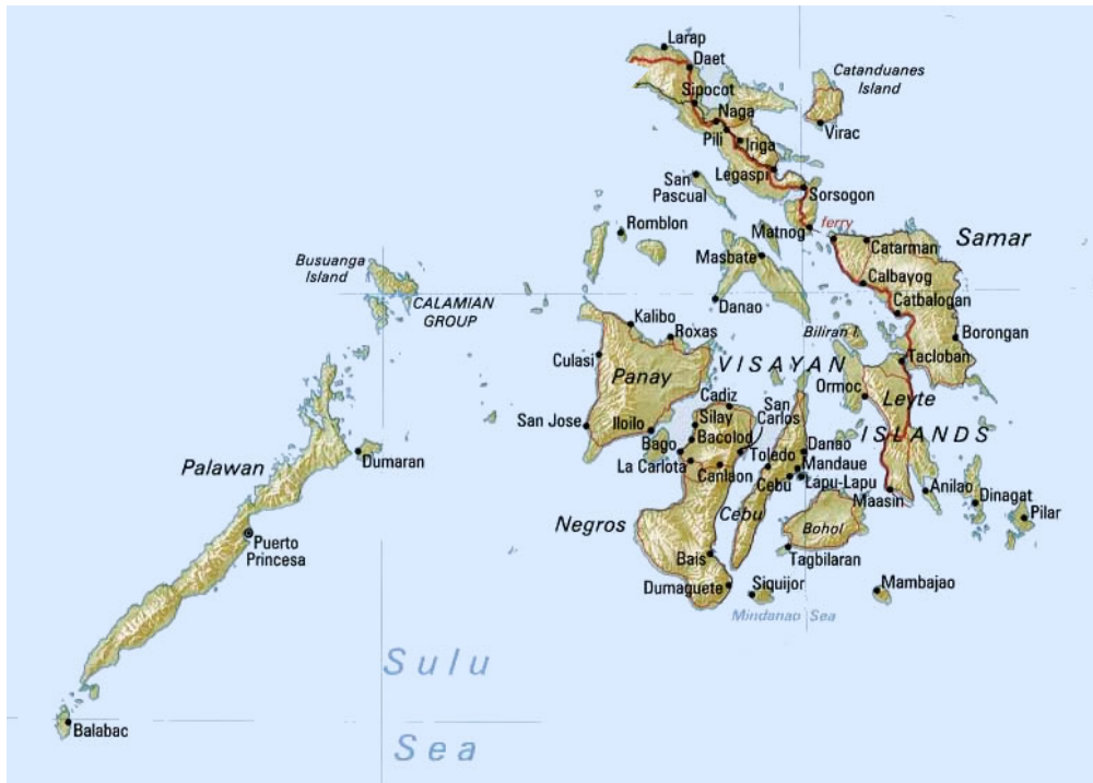
Map 1: Super Region Central Philippines